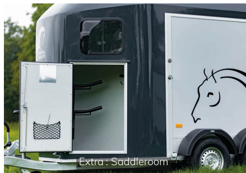
Extra : Saddleroom